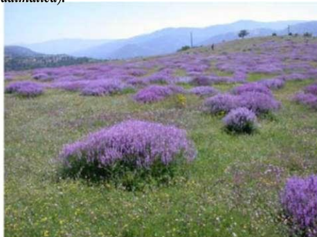
Figure 3. Thermophilous grasslands of Pcinja valley. P. sativum subsp. elatius inhabits the lower zone of northerly

exposed slopes of Mount Kozjak (UTM square EM-78; Fig. 1) on the left side of the valley. The slopes are covered by thermophilous submediterranean forests and scattered scrub vegetation consisted of pubescent oak ( Quercus pubescens ) and prickly juniper ( Juniperus oxycedrus ) overgrowing siliceous rocky ground. Two small groups of the individuals were recorded in the edges of the forests, in open spaces between the trees and shrubs, and on the sides of paths through the foothills (Fig. 4). A wealth of flowering herbaceous plants were in full bloom in May. The following plant list, though not complete, indicates the floristic and ecological flora which occur most commonly with tall pea: Fumaria petteri subsp. thuretii , Cardamine graeca , Moenchia graeca , Scleranthus perennis subsp. dichotomus , Tuberaria guttata , Hypericum montbretii , Potentilla laciniosa , Comandra elegans , Astragalus onobrychis , Chamaecytisus triflorus , Lens nigricans , Vicia tenuifolia subsp. dalmatica , Jasione heldreichii , Campanula lingulata , Fritillariagussichiae , Iris suaveolens . Both Pisum sativum subsp. elatius subpopulations inhabit a relatively small area, restricted exclusively to the gorge of Pcinja, and are included in the Natural Asset "Dolina reke Pcinje" which is protected at the national level as The Landscape of Outstanding Features.