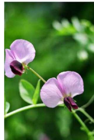
Figure 5. P. sativum subsp. elatius from the new recorded population, a detail with flowers.