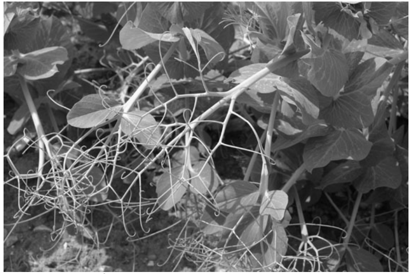
Fig. 2. Plants of JI 3129 growing outside

The novel afila allele offers a number of useful features that warrant further investigation. It is possible that the presence of a pair of leaflets at each node may increase the photosynthetic capacity of the plant and enable further increases in biomass at lower densites. The presence of additional leaflets may result in an increase in the leaf area index of a crop early enough in crop development to cut light levels penetrating the crop and thus help suppress emerging weeds (Fig. 2). Despite a reduction in