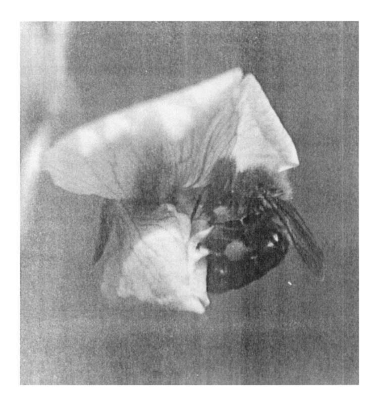
Fig. 1. A honey bee ( \underline{\text{Apis mellifica}} ) visiting an open flower and gathering pale pollen.