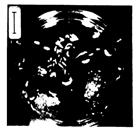
Fig. 2. Embryogenic callus with embryoids and embryos in suspension (vertical bar : 1 cm).