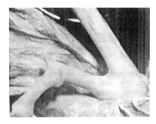
Fig. 2. Axil of normal plant (left) and from art plant (right) showing swollen base of peduncle in art plant (right) vs normal plant (left).