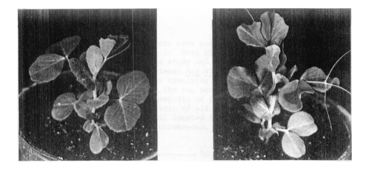
Fig. 1. Normal seedling compared with seedling carrying arthritic (<u>art</u>) mutant (right).

In 1978, L. G. Cruger provided me with seeds of a spontaneous mutant he had isolated in the early 60's from the cultivar 'Olympic'. In the seedling stage, mutant plants (Fig. 1) bear some resemblance to plants carrying either un or sil; leaflets and stipules are undulate and partially folded. These phenotypic characteristics are very distinct in pure populations and sufficiently distinct in segregating populations to make the mutant a suitable seedling marker. Unlike un or sil, however, the upper internodes of adult plants become foreshortened and, after the pods have developed, the plants might mistakenly be regarded as fasciated because the pods are clustered at the top. Perhaps, however, the most diagnostic feature of this mutant occurs in the reproductive phase of development. The base of the peduncle becomes swollen and the actual site of attachment to the stem is also more smoothly rounded than in non-mutant plants (Fig. 2). The nodes that mark the union between peduncle and pedicel appear to be abnormally enlarged as well. Thus, the mutant plants can be discerned with comparative ease at virtually all stages of the life cycle. The characteristic swollen joints prompts me to suggest the name arthritic and the symbol art for this mutant.